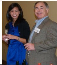
Right: Student Volunteers from Central High School